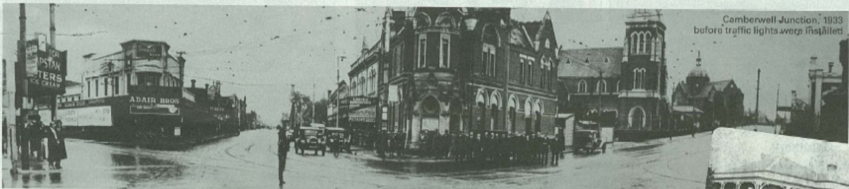
Camberwell Junction, 1933 before traffic lights were installed