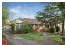
Mountain View Road