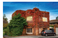
Denmark Hill Road